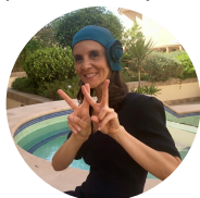
Ferial BOUZEKRINI Ambassador DUBAI (UAE)