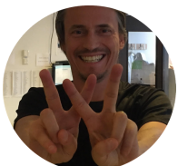
Lasse ERIKSEN Ambassador NORWAY