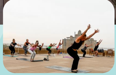
Mineral Wells, TX

Hit the headlines as the touristic destination that people want to explore for wellness.