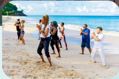
Antigua & Barbuda

Prolong the high season with the irresistible offers of your tourism partners (associations, hotels, sports & fitness clubs, yoga studios, outdoor activities...) in September and October.