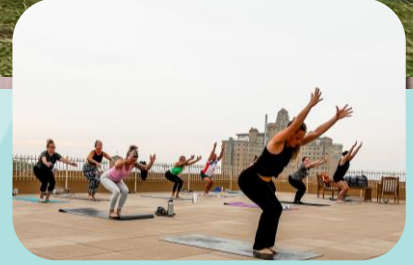
Mineral Wells, TX

World Wellness Weekend is a pro-bono event supported by 4 Ministers of Tourism, 2 Health Ministers and 30 Mayors.