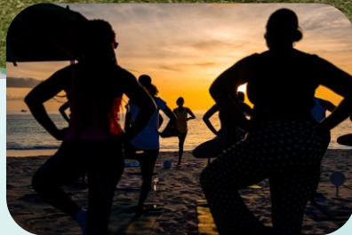
Antigua & Barbuda